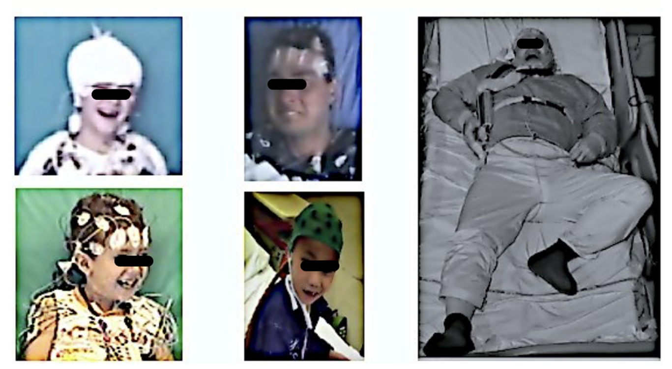
Fig. 1. Emotional and non-emotional laugh or smile. -On the left two patients express an emotional laugh. The presence of conveyed emotion is associated with the expression of spontaneous mirth through both mouth and eye region activation. The patients at the center of the figure express a smile without conveying emotion, similar to the patient on the right side, showing a non-emotional laugh. Mechanical behavior is observed in the mouth region.