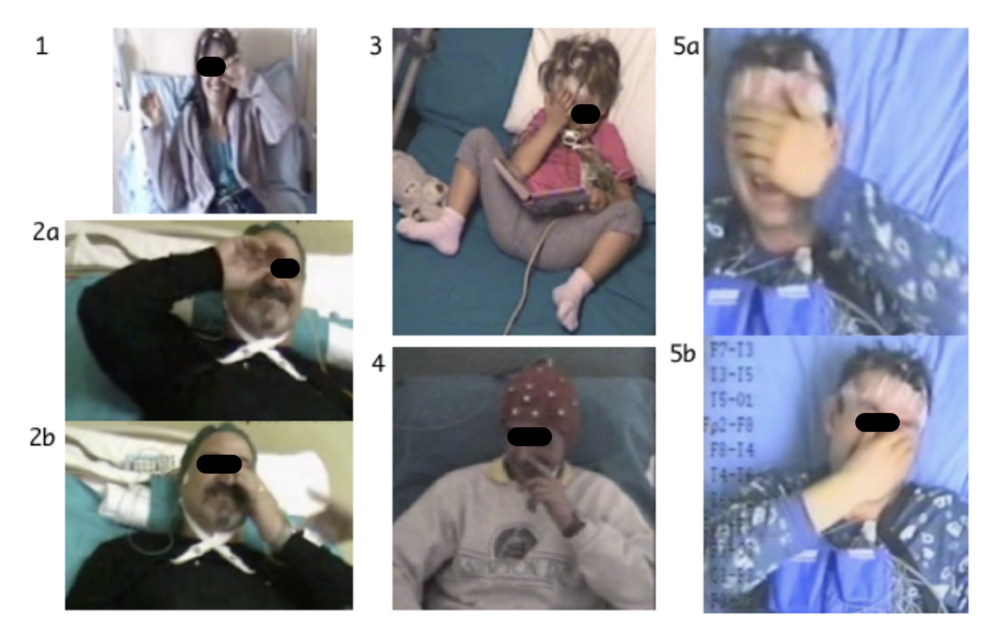
Fig. 2. Hand-to-face sign. The hand-to-face sign of five patients with hypothalamic hamartoma is shown. In all patients except one, the hand is directed to cover the eye region, while in the patient of box 4 the hand is directed to the mouth region. In two patients (box 2 and box 5) both hands are used alternatively to cover the face throughout the seizure.

objective or subjective symptoms, and with more emotional involvement, compared to the seizures of patients with other etiologies. Moreover, the ictal sign of "hand-to-face" was observed only in patients with hypothalamic hamartoma. Gelastic seizures arising from sleep were more frequent in the second group.